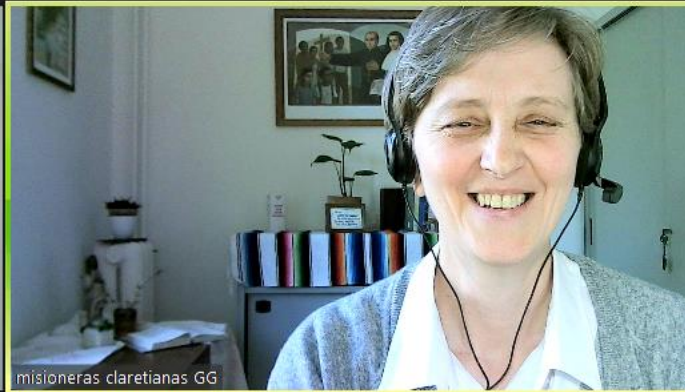
misioneras claretianas GG